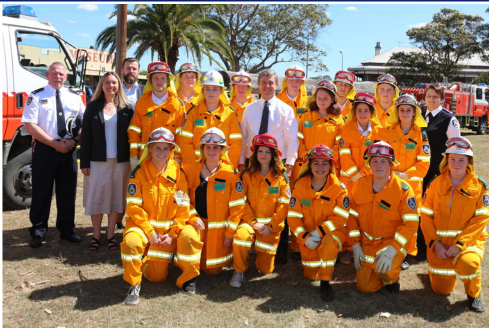
Graduates of the 2018 NSW RFS Secondary Schools Cadet Program.