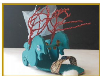
Moon Shoes and Seahorse Shoes