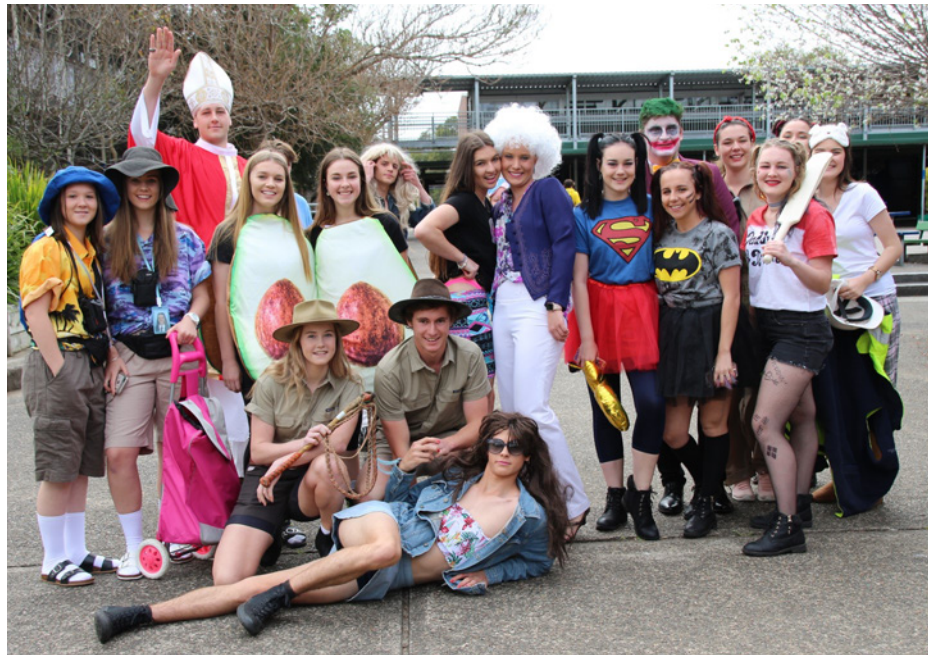
Year 12 students celebrated their final days at school with a fun slave auction. Congratulations on completing the HSC and don't forget - sign out day is Friday 9th November.