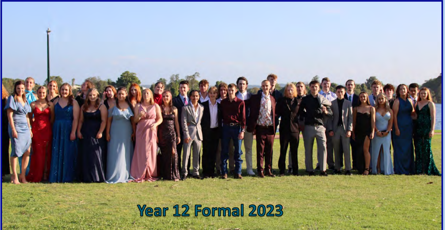
Year 12 Formal 2023