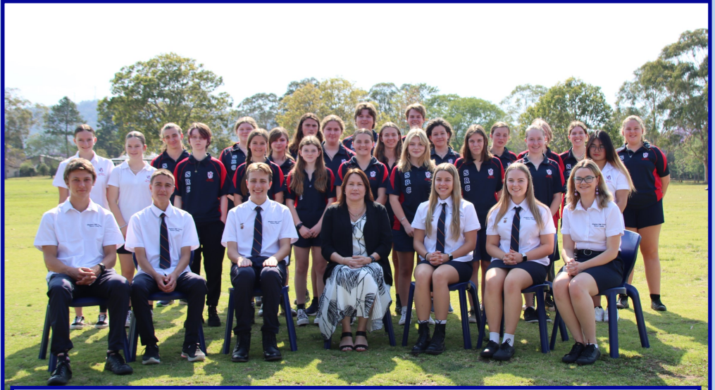
School Leaders and Representative Council 2024