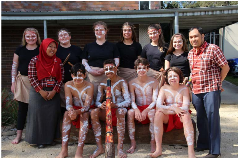
The Wakul Gudida group perform at the welcome assembly. Full story on page 3.