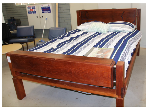
Queen bed with Lichtenburg features Dominic Majkic