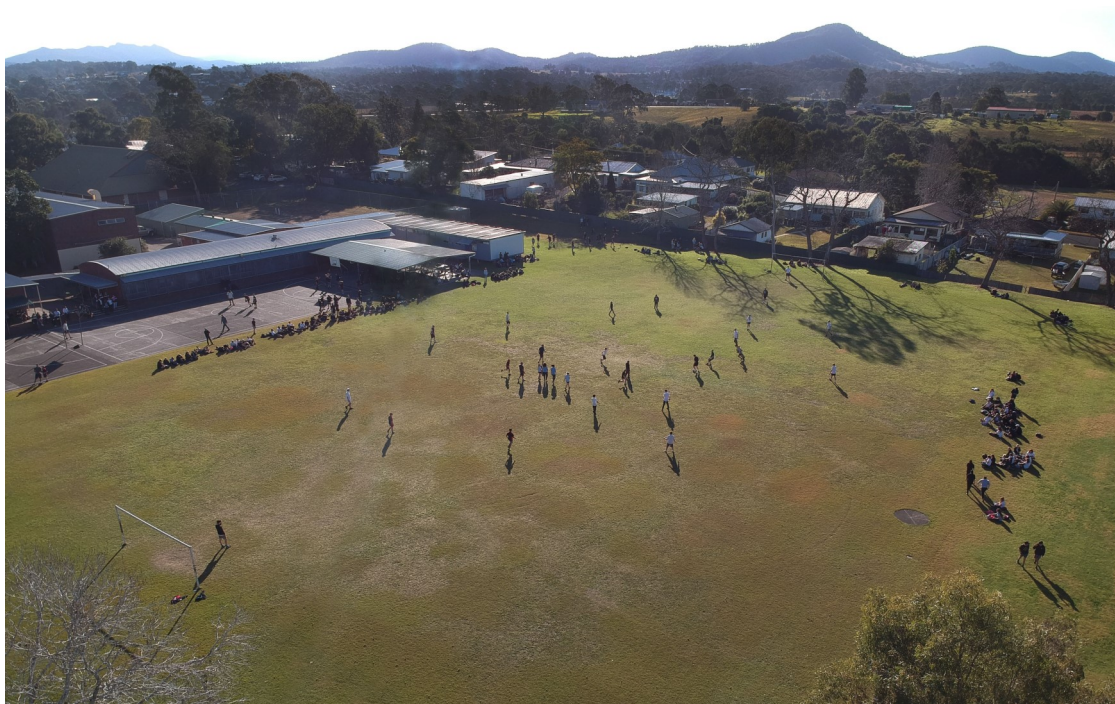
Drone view of the recent Indigenous soccer match on the school oval.