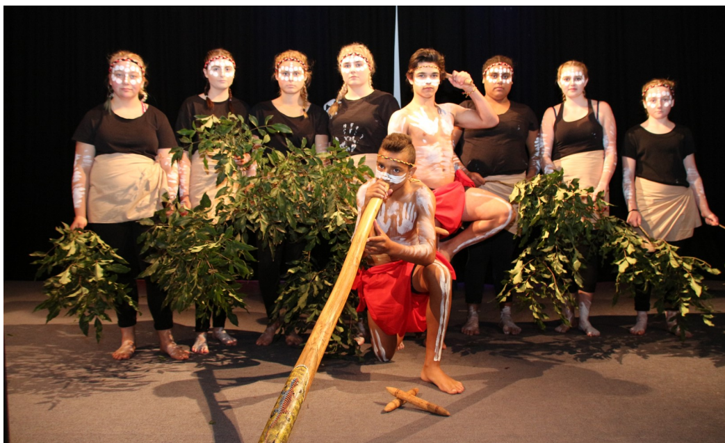
Wingham High NAIDOC celebrations.

EFTPOS facilities available at the Accounts Office and the Canteen.