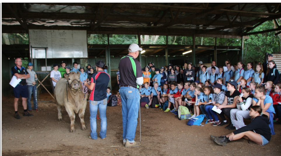
106 Primary school students visit Wingham High for 'A day at the farm' during Beef Week.

EFTPOS facilities available at the Accounts Office and the Canteen.