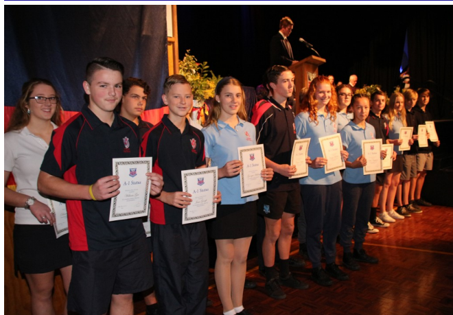
Year 9 - A1 Status Recipients