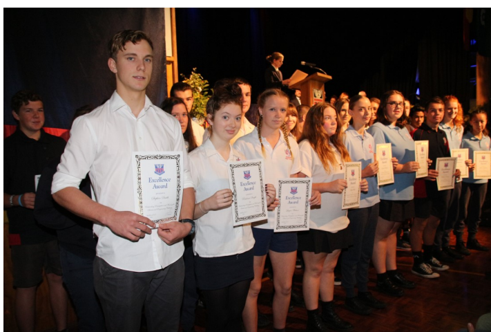
Left - Winning Team at the 2017 Science and Engineering Challenge