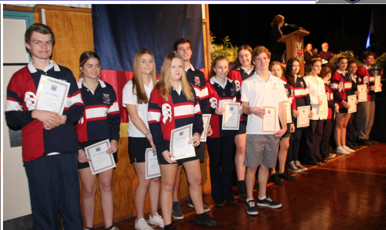
Year 12 - A1 Status Recipients