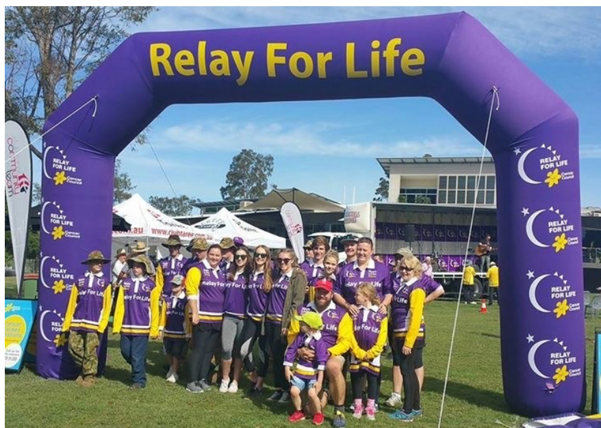
Wingham High's Relay for Life team raise $3768.64

Hard copies are available at the Front Office and the Library.