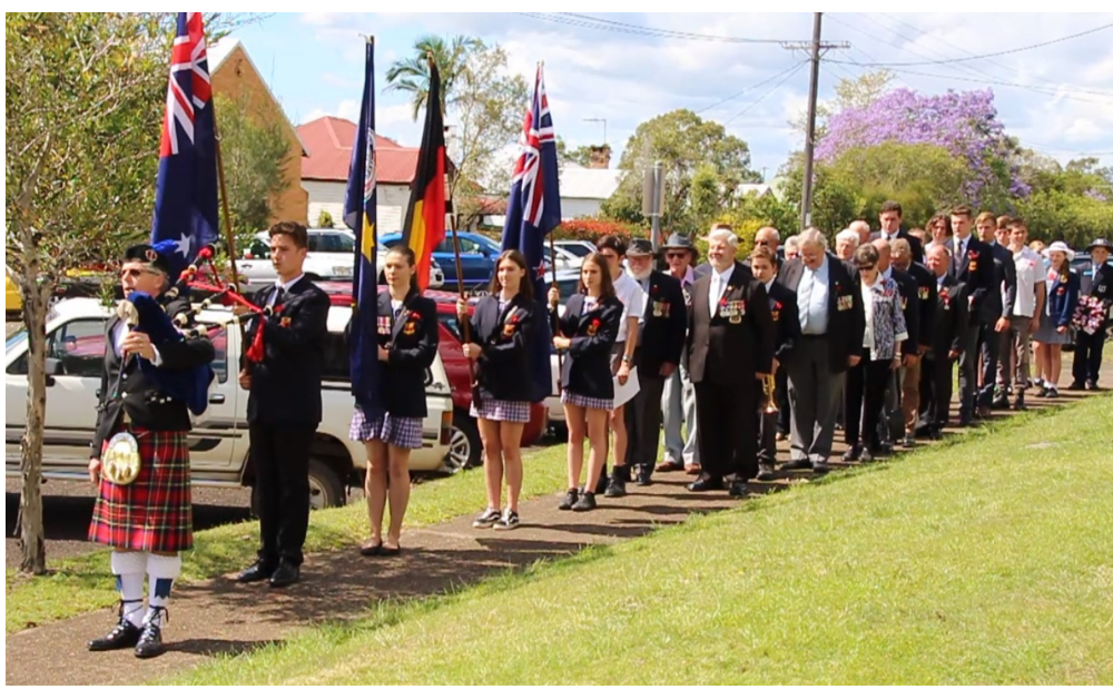
Wingham High School students attend Remembrance Day Service

Hard copies are available at the front office and the library.