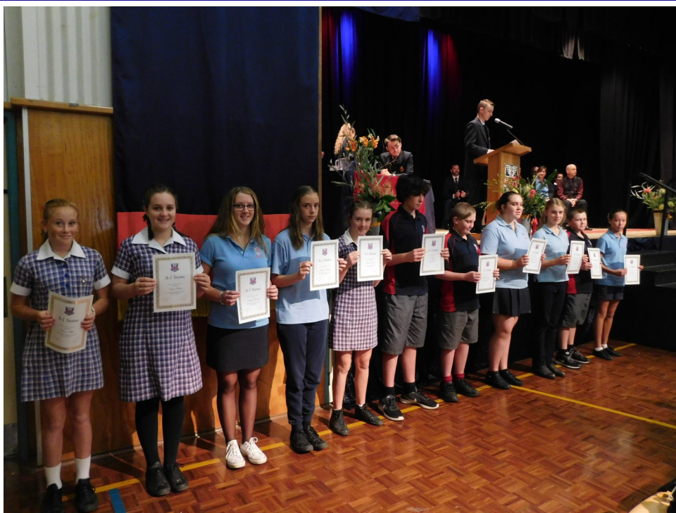
Year 8 students receiving their A1 Status awards at the Excellence Assembly.

EFTPOS facilities are now available at the Accounts Office and the Canteen.