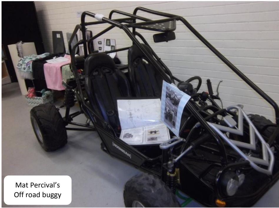
Mat Percival's Off road buggy