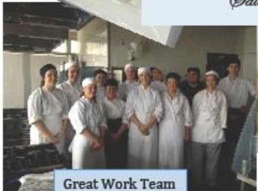
Great Work Team