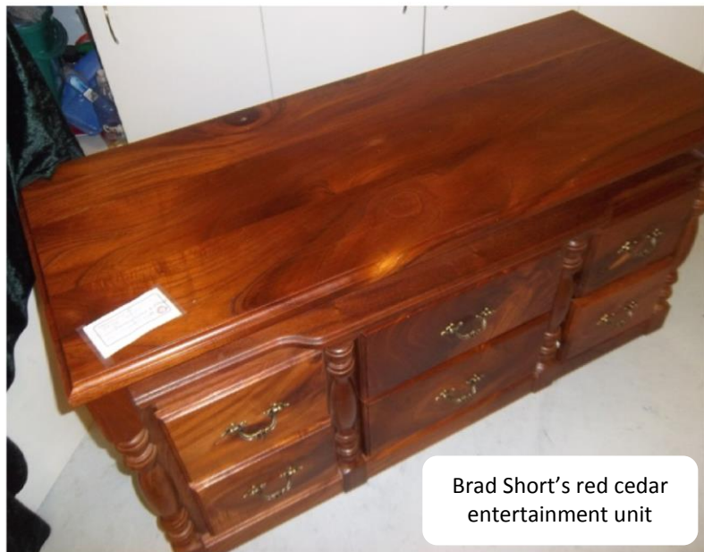
Brad Short's red cedar entertainment unit