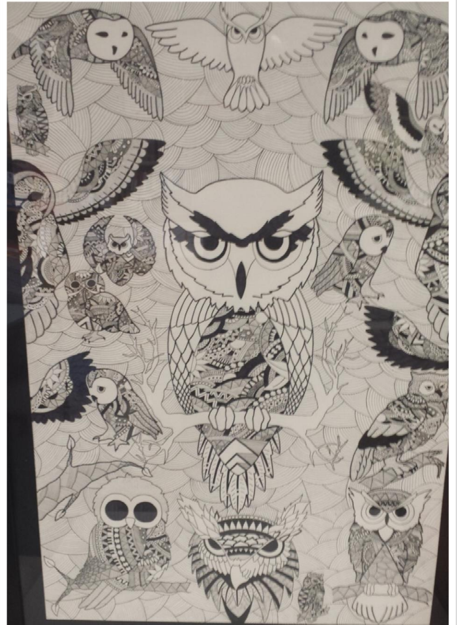
Visual Art major work by Teelah Hodges 'From darkness comes wisdom'