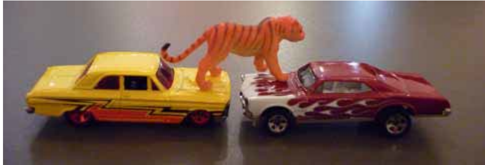
'Cars and Tiger' Callum aged 7. ART CENTRAL Still Life & found object photography workshop 2012

10.30 - 12 noon Saturday* $15 all materials supplied No Booking required