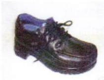
Leather School Shoes

Appropriate Footwear includes: strong, leather shoes which cover the entire foot.