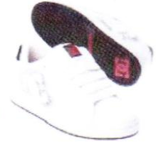
Leather Skate Shoes