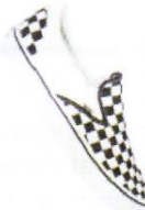
All Canvas Shoes