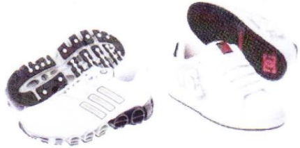
Leather Skate Shoes